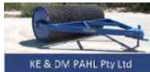
KE & DM PAHL Pty Ltd